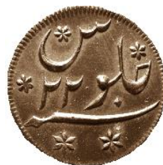
sanah 22 julūs (= In the 22 nd year of his reign). Within a raised, toothed rim. NB stars below legend.