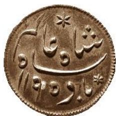
shāh 'ālam bādshāh 1195 (= Shāh 'Ālam Emperor AH 1195). Within a raised, toothed rim.