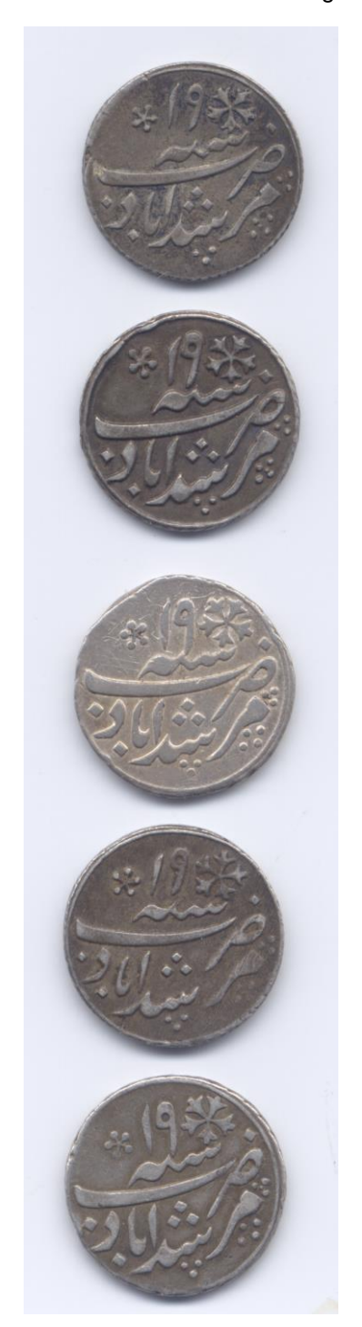
Order: Calcutta, Calcutta, Dacca, Calcutta, Dacca