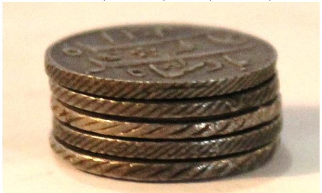
Dacca definitely seems to have cruder edge markings 3<sup>rd</sup> and 5<sup>th</sup> from top