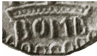
Correct Spelling for BOMB