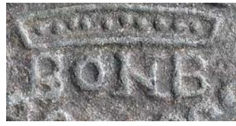
BOMB Mis-spelt BONB (from RJ)