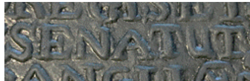
SENATUS Mis-spelt SENATUT