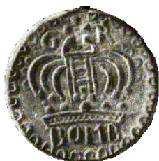
A large crown with GR above. The GR is divided by the orb and cross of the crown. Below the crown is the legend. All within a border of half loops.