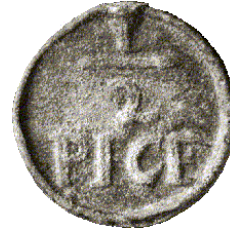
The value in English within a plain raised border