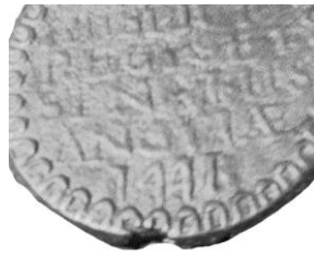
Looks like 1741 but the 1 looks a bit like a B