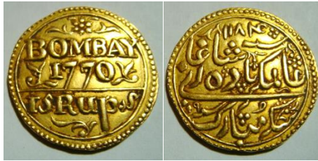
Modern counterfeit. 11.05g