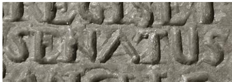
Correct Spelling for SENATUS