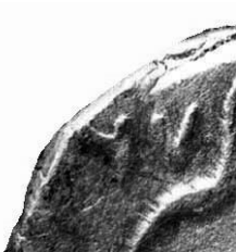
A – Date in top part of legend. Vowel mark - Open