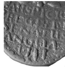
1741 that could be mistaken for 1711

Some may be examples of the numerous contemporary forgeries discussed in the records.