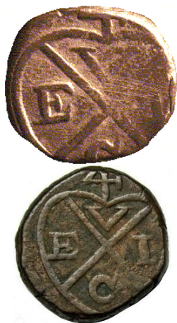
The balemark of the Company