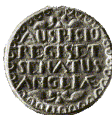
AUSPICIO REGIS ET SENATUS ANGLIAE