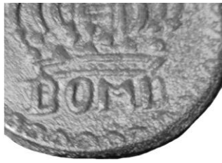
Weak B at end. Might be read as BOMI