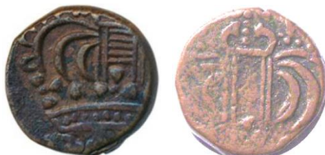
Half Pice with loops (left) and beads (right)