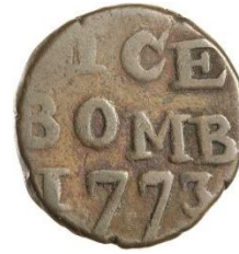
The legend PICE BOMB and date below.