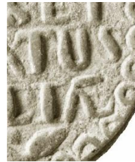
Diphthong - Second Bar of E missing