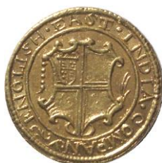
The shield of arms of the Company within a plain circle and surrounded by the legend. All within a beaded circle.