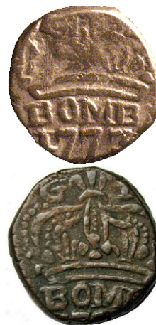
Crown with G R above separated by the orb and cross. The legend and date below the crown.