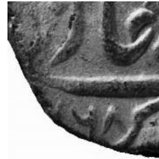
B – Date in bottom part of legend Vowel mark - Closed