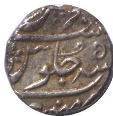
zārah munbai sanah [RY] julūs maimanat mānūs (= Struck at Bombay in the [RY] year of tranquil prosperity)