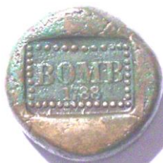
Old native copper coin countermarked with an oblong stamp containing BOMB 1788 within a beaded border.

These very rare coins seem to come in various weights as can be seen from the weight range below.