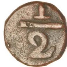
Value of either 1/2 or 1/4