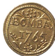
An inscription with floral ornaments above and below. All within a beaded boarder.