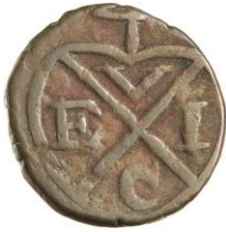
The balemark of the Company