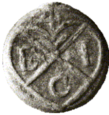
Balemark of the Company