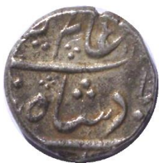
sikka mubārah bādshāh ghāzī ‘ālamgīr [AH] (= The auspicious coin of the Victorious Emperor ‘Alamgīr [AH])

The existence of the quarter and eighth rupees is somewhat doubtful but they are listed for reference.