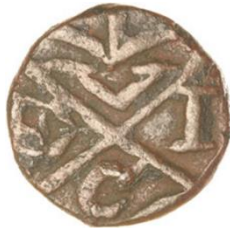
The balemark of the Company