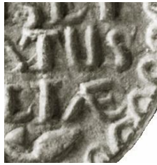
Diphthong correct This minor difference is not listed as a variety in the table above