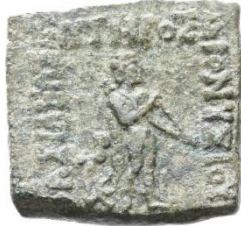
ΒΑΣΙΛΕΩΣ ΣΩΤΗΡΟΣ ΔΙΟΝΥΣΙΟΥ, Apollo standing right, holding bow and arrow