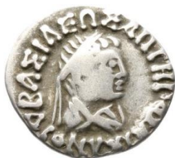
ΒΑΣΙΛΕΩΣ ΣΩΤΗΡΟΣ ΔΙΟΝΥΣΙΟΥ, Bust of Dionysios, diademed and draped right