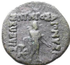
ΒΑΣΙΛΕΩΣ ΣΩΤΗΡΟΣ ΔΙΟΝΥΣΙΟΥ, Apollo standing right, holding bow and arrow