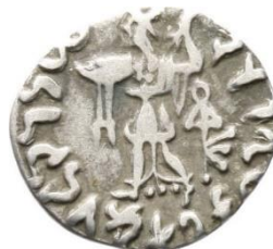
Ἀθηνᾶς ἰστῆρας ἰσχυροῦ, Athena standing left, holding shield horizontally with left arm, throwing thunderbolt with right hand