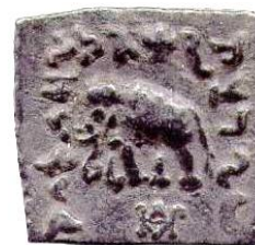
elephant left, monogram below