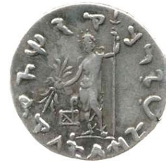
Zeus standing facing, wearing himation, carrying thunderbolt left, and long sceptre right, monogram below left, Kharosthi legend: Maharajasa dhramikasa Heliyakreyasa

Actual Weight (g) Actual Diameter (mm) Composition Silver