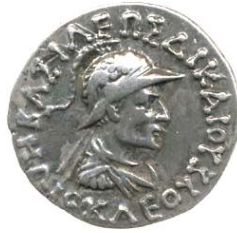
bust of king right, wearing crested helmet.