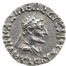
diademed bust of king right

BIGR splits this into two types based on the spelling of Heliocles – Helijakreyasa (BN 2A-2F) or Helijakreasa (2G-2I)