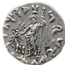
Zeus standing, holding sceptre and thunderbolt

Actual Weight (g) Actual Diameter (mm) Composition Silver