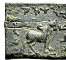
Bull facing right