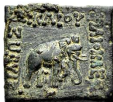
Elephant facing right