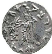
Zeus standing, holding sceptre and thunderbolt