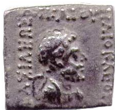
diademed, bearded bust right

BIGR splits this into three types based on the spelling of Heliocles – Heliyakreyasa (BN 7A-7C) or Heliyakresasa (7D-E) or Heliyakreasa (7F)