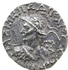
helmeted bust of king left with javelin on shoulder