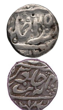
NB. Bottom coin, leaf ornament where mint name should be