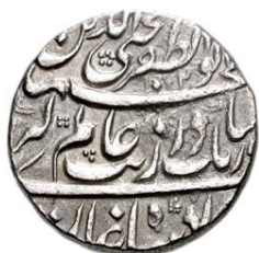
abū al-zafar muhayyi al-dīn Aurangzeb ‘ālamgīr bahādur bādshāh ghāzī (=