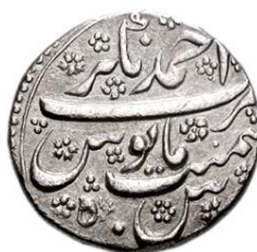
zarb aḥmadnagar sanah [RY] julūs maimanat mānūs (= struck at Aḥmadnagar in the [RY] year of his reign of tranquil prosperity).