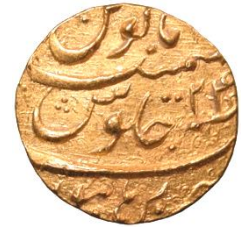
zarb burhānpūr sanah [RY] julūs maimanat mānūs (= Struck at Burhānpūr in the [RY] year of his reign of tranquil prosperity).