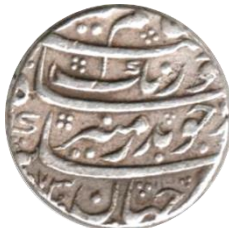
sikka zad dār jahān chau mihr mūnīr shāh aurangzeb 'ālamgīr (= Struck money through the world like the shining sun. Shāh Aurangzeb 'Ālamgīr).