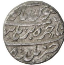
baldat i fakhira (= Splendid city)