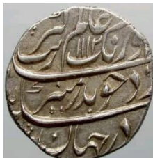
sikka zad dār jahān chau badr mūnīr shāh aurangzeb 'ālamgīr (= Struck money through the world like the shining moon. Shāh Aurangzeb 'Ālamgīr)