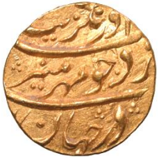
sikka zad dār jahān chau mihr mūnīr shāh aurangzeb 'ālamgīr (= Struck money through the world like the shining sun. Shāh Aurangzeb 'Ālamgīr)