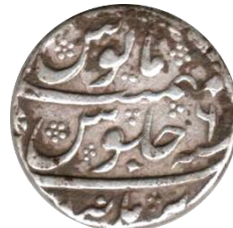
zarb burhānpūr sanah [RY] julūs maimanat mānūs (= Struck at Burhānpūr in the [RY] year of his reign of tranquil prosperity).