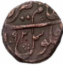
falūs 'ālamgīr shāhī