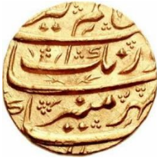
sikka zad dār jahān chau mihr mūnīr shāh aurangzeb 'ālamgīr (= Struck money through the world like the shining sun, Shāh Aurangzeb 'Ālamgīr)