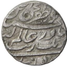
abū al-zafar muhayyi al-dīn aurangzeb ' ālamgīr bahādur bādshāh ghāzī