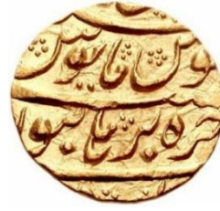
zarb baldat I fakhira burhānpūr sanah [RY] julūs maimanat mānūs