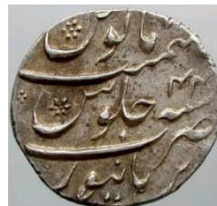
zarb burhānpūr sanah [RY] julūs maimanat mānūs (= Struck at Burhānpūr in the [RY] year of his reign of tranquil prosperity).