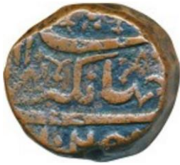
jahāngīrī sanah [AH] [RY]