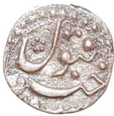
Khair Qubūl (Graces received)