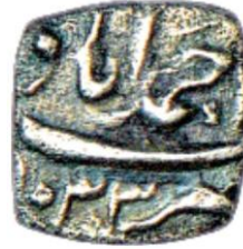
zarb aḥmadābād [RY]