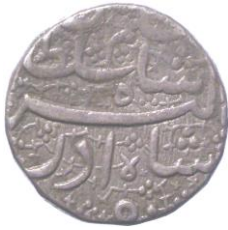
RY at bottom