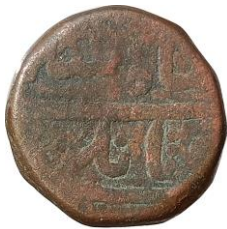
chow tānkī /shāh salīm