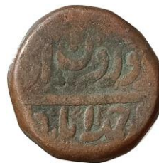
[Month] ilāhī / aḥmadābād 50