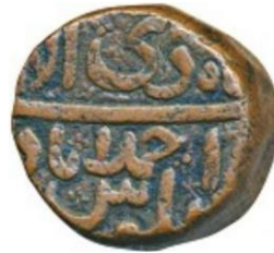
falūs aḥmadābād, ilāhī māh [Month]