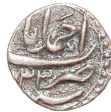
ḡarb aḥmadābād [RY]

Actual Weight (g) ~1.4 Actual Diameter (mm) Metal Silver