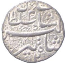
RY at bottom