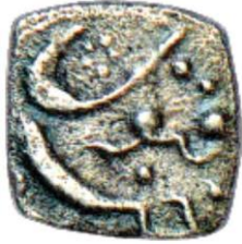
Khair Qubūl (Graces received)